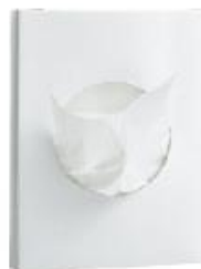
N-I16 Pack of 50 bags