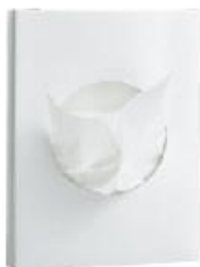
N-TR039016EA Hygiene Bag Refill (30's)