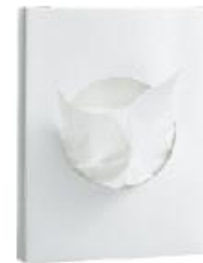
N-AB2 Pack of 100 bags